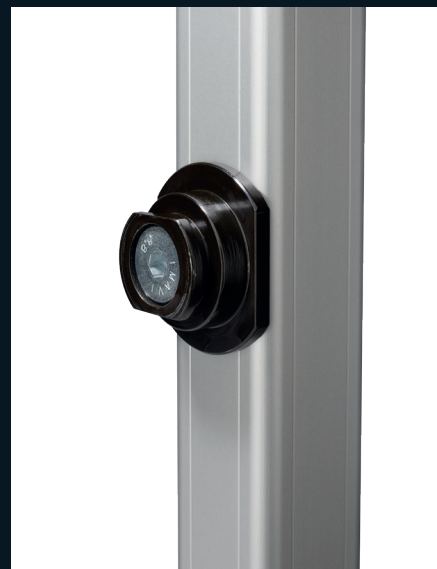
T-32 SHIFT Adapter

It is now possible to assemble and adjust a complete mobile projection screen system in less than five minutes. Save time AND save money with premium quality components made in Austria.