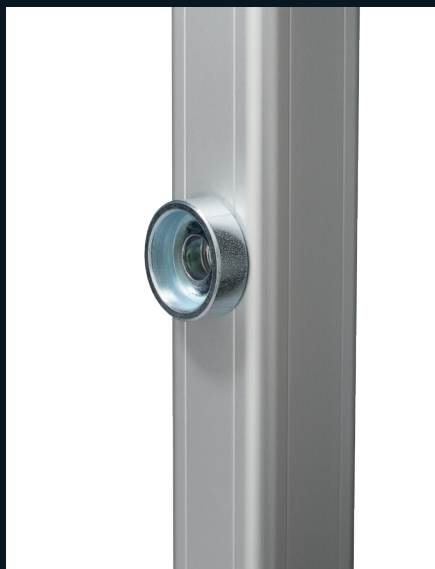
Standard Monoblox Frame